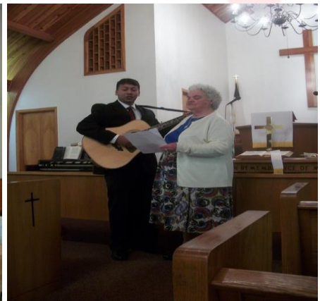
Wesley Meadow UMC