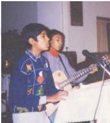
Centenary Methodist- India